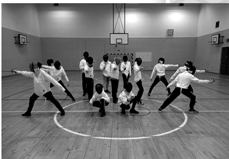
Elgin En Garde fencers...en garde!